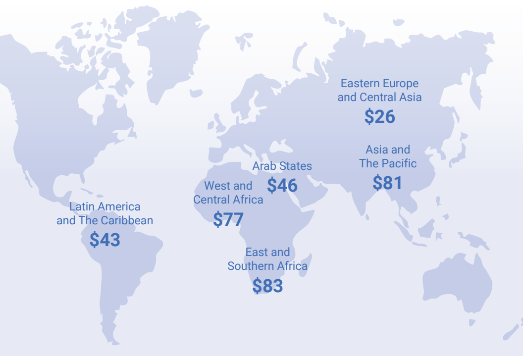
CORE EXPENDITURES BY REGION in million dollars

From 2023 to 2024, core resources for the least developed and landlocked developing countries dropped by 2.7 per cent or over $15 million. This means that fewer flexible resources are reaching countries with the greatest needs and the least capacity to absorb shocks.