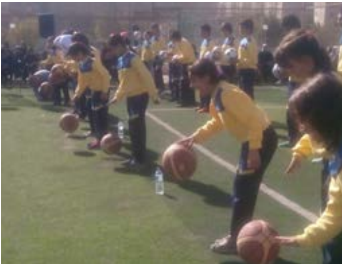
Syrian girl basketball team in 6th October city in Egypt receiving training and health-related messages.