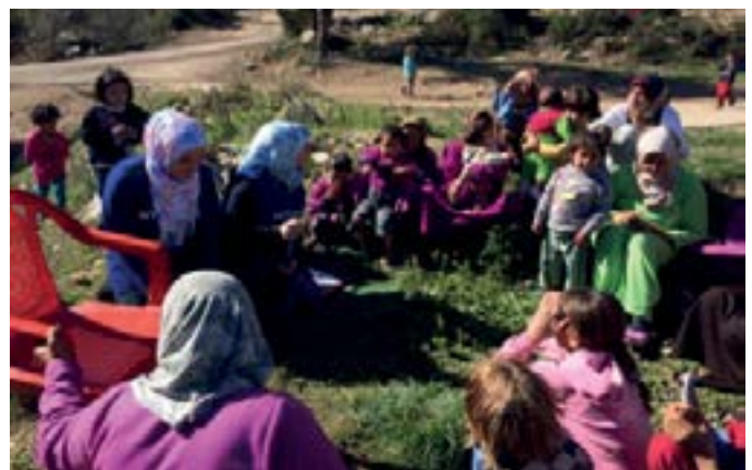
Syrian women and girls attending a GBV outreach session in Chouf, Lebanon.

UNFPA organized 28 community awareness workshops on GBV and reproductive health related issues (13 sessions on reproductive health and 15 on GBV) targeting 348 Syrian refugees in Cyber City, King Abdullah Park and Emirati Jordanian camps. The sessions focused on safe behaviours in the camp and positive behaviors within the family, family planning, safe motherhood, breastfeeding, early marriage, pregnancy and HIV/Aids, while GBV awareness session focused on domestic violence, GBV prevention and response, sexual violence, sexual harassment, and available services in the camps.