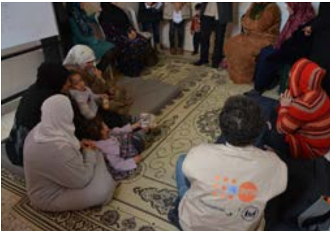
UNFPA organized awareness sessions on gender-based violence at a shelter based in Damascus, Syrian Arab Republic.