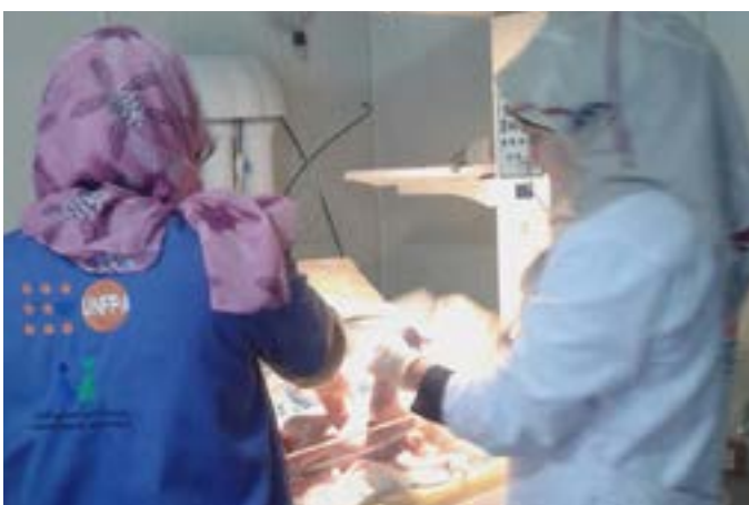
UNFPA teams at the reproductive health clinic in Za'atari camp in Jordan provide normal delivery services for the women in the camp.

In Azraq camp, as part of awareness creation and health education for reproductive health beneficiaries, midwives in the two clinics provided a total of 20 health educational and awareness sessions on reproductive health services with messages to 182 Syrian women in