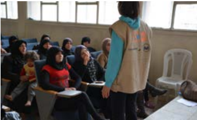
Awareness-raising session on reproductive health topics, held in cooperation with the Syrian Family Planning Association (SFPA), which is being carried out at numerous shelters in Damascus, Syrian Arab Republic.