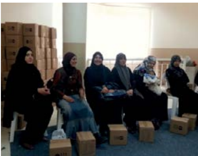
UNFPA distributed dignity Kits to Syrian women during a basic life skills session in Chouf, Lebanon.

WOMEN AND GIRLS SAFE SPACES: Support of two safe spaces in 6th October and Masr al-Jadida for adolescent girls has started this month. The spaces will provide several services, including psychosocial support, training, recreational activities, awareness campaigns and sport activities.