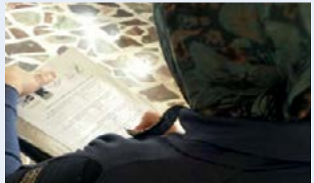
A community woman leader facilitating a session on hygiene, Berqayel, North Lebanon.