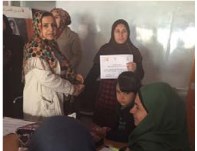
Syrian women attending intensive Kurdish language training session at Rajan, UNFPA-supported women's centre in Erbil, Iraq.

RECREATIONAL ACTIVITIES IN THE WOMEN CENTRES: A total of 890 women and 64 girls attended various recreational activities in UNFPA-supported women's spaces in camps and non-camp settings in the Kurdistan region. Twenty-five women recently graduated from the Kurdish language (50 days) intensive course at Rajan women's centre in Erbil. The Kurdish language will help the women to fit within the region and be able to find jobs.