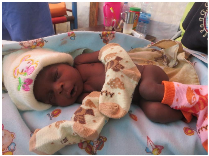
A premature baby keeps warm with socks and hat in UNFPA supported clinic in the Juba IDP camp.