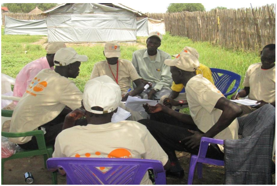
Youth dicuss GBV prevention at a training in Awerial this week.

In Mingkaman The UNFPA supported maternity centre has seen a two fold increase in deliveries, this is largely due to increased prescence of midwives. There are consistently increasing numbers of deliveries and ANC visits; 62 percent of the expected births for the week took place within health facilities.